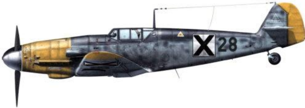
Bf 109G-2, serial: 28 (20/7057), 682 Jato, 3/6 Orljak, pilot Lt.Stoyan Stoyanov, Sqn CO. Karlovo, Bulgaria, early 1943.