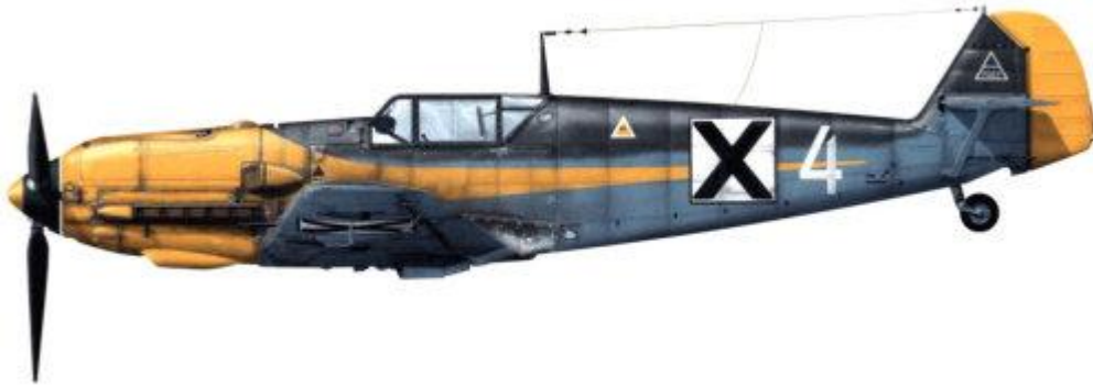
Bf 109 E-7 "white 4" flown by Stoyan Stoyanov in 1943.