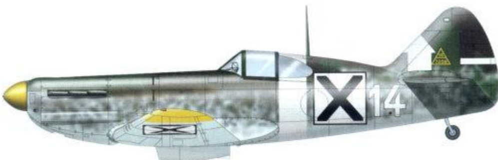
Dewoitine D.520, serial 14 (7256), 6th Iztrebitelen Polk, Karlovo, beginning of the 1943.