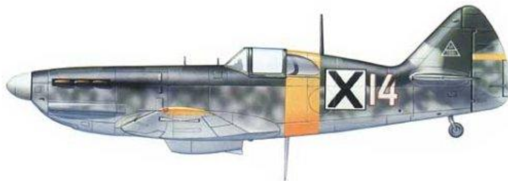
Dewoitine D.520, serial 14, Royal Bulgarian Air Force.